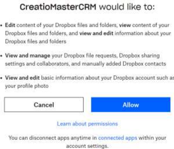
Pic 2. Consent page

After you press Allow button DropBox will provide you with short-lived authorization code for your Creatio