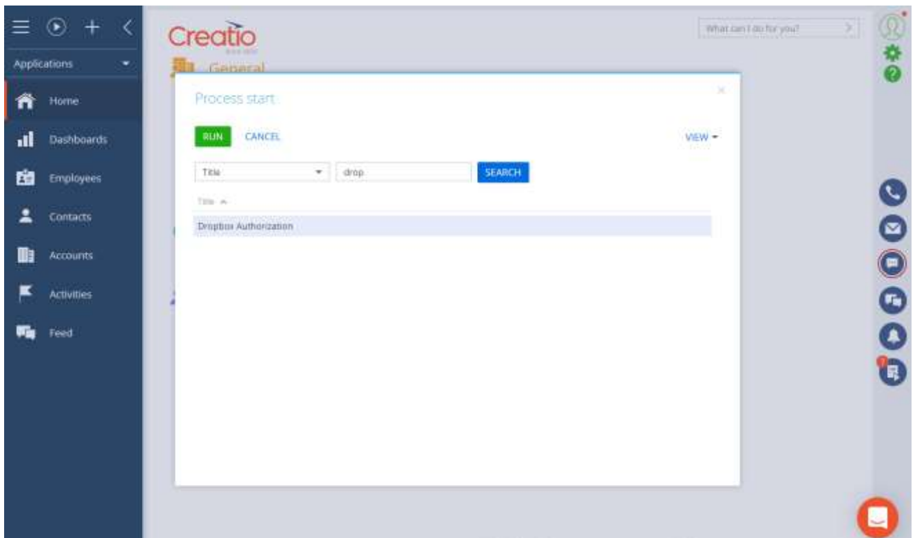
Pic 1. Run Business Process

Be sure that you signed into the required DropBox account. Run business process Dropbox Authorization