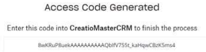
Pic 3. Authorization code in DropBox

Copy this Authorization code and paste it in the corresponding field on the page in Creatio.